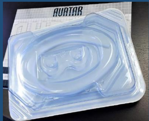
(Dual barrier packaging tray-within-tray)